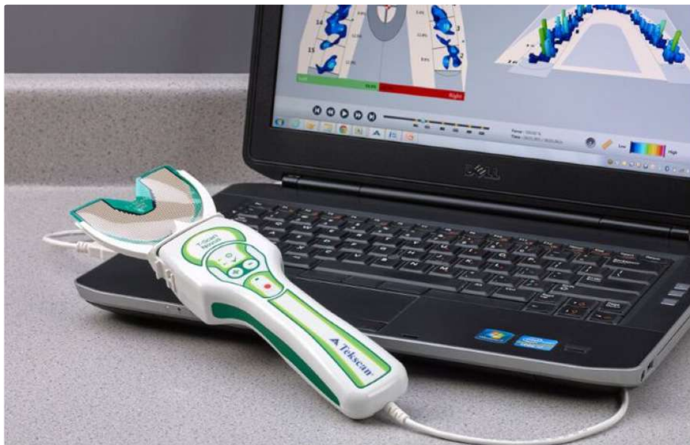
Figure 3: The T-Scan 10 Novus recording handle loaded with a Novus HD sensor, that is connected via USB to the T-scan 10's companion, color-coded force and timing software

that occlusal data with the marking of teeth with thin articulating paper (Accufilm 23 micron, Parkell, Inc., Farmingdale, NY, USA), to isolate the data-determined problem contacts. Because the T-Scan sensor does not mark the teeth, thin articulating paper is required to make targeted occlusal adjustments of the problem contacts, where only the data-determined problem contacts are adjusted, regardless of the appearance characteristics of the neighboring articulating paper marks. In this combined method, all healthy low force occlusal contacts are left untreated, which dramatically improves the outcomes of any T-Scan guided occlusal adjustment procedure.