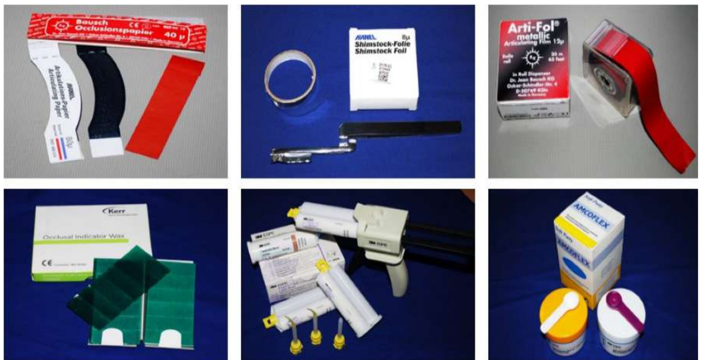
Figure 1: The Static Occlusal Indicators; articulation paper strips, shim stock foil, elastomeric impression materials (syringe mixed, and hand mixed), and occlusal wax sheets